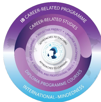
Career-Related Programme 11 th and 12 th Grades

Research suggests many benefits to choosing the DP. The programme aims to develop the students who have excellent breadth and depth of knowledge – students who flourish physically, intellectually, emotionally and ethically.