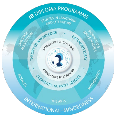
Diploma Programme 11 th and 12 th Grades

The MYP provides a challenging framework that encourages students to make practical connections between their studies and the real work. The MYP is inclusive by design; students of all interests and academic abilities can benefit from their participation.