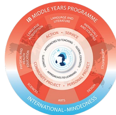
Middle Years Programme 6 th – 10 th Grades

The PYP prepares students to become active, caring, lifelong learners who demonstrate respect for themselves and others and have the capacity to participate in the world around them. It focuses on the development of the whole child.