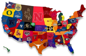
COLLEGE T-SHIRT DAY

To show our commitment to higher education, students may substitute a college or university shirt for their uniform shirt on early release days. All other uniform requirements remain the same and students who do not wish to wear a university or college shirt are to wear uniform tops. Remember, professional sports teams are not universities!